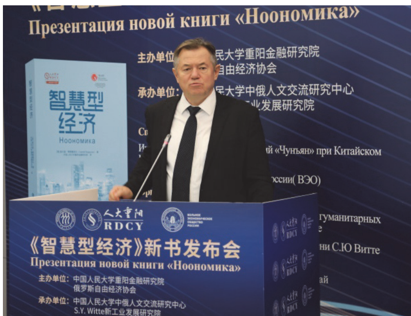
Sergey Glazyev, academician of the Russian Academy of Sciences

interests of the private sector into account. The government should also create the most comfortable conditions to stimulate the creativity of citizens.