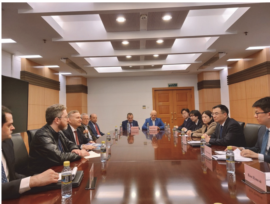
Meeting at the Ministry of Foreign Affairs of the People's Republic of China

The course and results of the visit of the delegation of the Free Economic Society of Russia and the IUE to Beijing were widely covered by Chinese and Russian mass media: Beijing Daily, Zhejiang Daily, CASS, CGTN, Shenzhen Satellite TV, Hubei Satellite TV, People's Pictorial, Sansha TV, Chinese Journal of Social Sciences, Caijing Magazine, Hainan Network Radio and Television Station, News Daily, Tianmu News, portals 52hrtt. com, Cj.sina.com.cn, K.sina.com.cn, Sohu, Qq.com, TASS, Russian Newspaper, magazine Breath of China. com, Cj.sina.com.cn, K.sina.com.cn, Sohu, Qq.com, TASS, Rossiyskaya Gazeta, Breath of China magazine, Volnaya Ekonomika magazine and others.