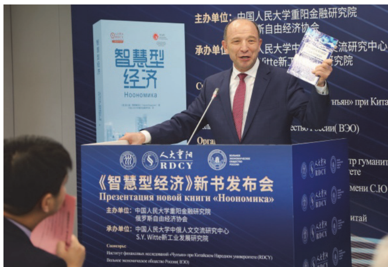
Vladimir Kvint, Foreign Member of the Russian Academy of Sciences

strategic statement, the course of our cooperation is the course of our interaction, it is the theory and method of noonomy and formulation of the strategic plan.